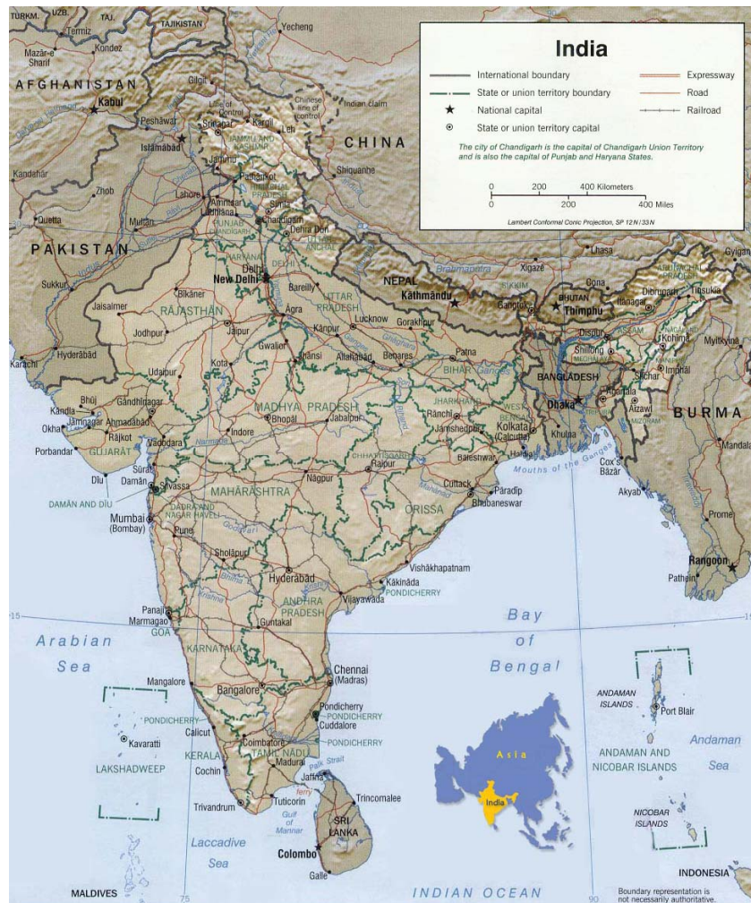
Figure 1: India and bordering states 13

This paper defines the Indian Ocean region (IOR) as bounded to the west by the Straits of Hormuz and a boundary extending southward along the eastern Arabian Peninsula and thence south along the east African coast; the Straits of Malacca and a boundary including the Indonesian archipelago, thence southward along the western Australian coast mark the eastern extremity. Setting these boundaries thereby includes the principal sea lines of communication (SLOCs) traversing the Indian Ocean. In 2012, these SLOCs transported two-thirds of the world's sea-borne trade in oil, including the majority of China's requirements. 14 For this reason, the