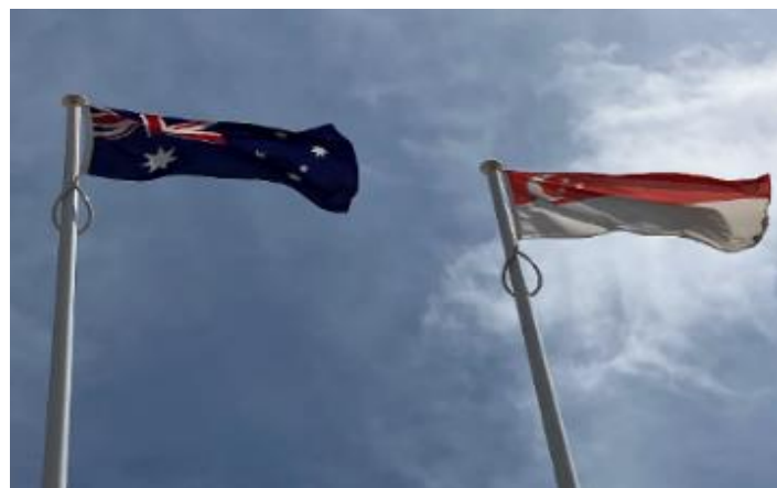
Above: The Australian and Singaporean flags flying high at Shoalwater Bay Training Area during the commemorative ceremony

Read more about the meals prepared for Singapore Armed Forces troops training at Shoalwater Bay Training Area, external link: 'Wallaby nasi lemak': How an Australian military camp kitchen whips up Singapore fare