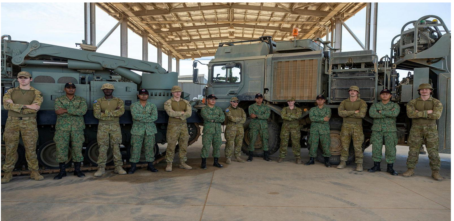
Above: ADF and Singapore Armed Forces personnel at a military display at the Maintenance Facility, Camp Tilpal

'Commemorating the opening of Shoalwater Bay Training Area facilities jointly developed under the Comprehensive Strategic Partnership between Australia and Singapore, Camp Tilpal, November 2024'