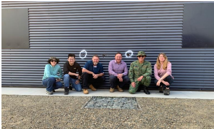
Above: Team members from the ASMTI Program Office, Singapore's Defence Science and Technology Agency and Australia Training Area Development Office during live-fire testing at Shoalwater Bay Training Area