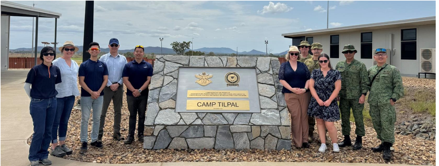
Above: Team members from the ASMTI Program Office, Singapore's Defence Science and Technology Agency and Australian Training Area Development Office at the Australia-Singapore commemorative plaque, Camp Tilpal

'Commemorating the opening of Shoalwater Bay Training Area facilities jointly developed under the Comprehensive Strategic Partnership between Australia and Singapore, Camp Tilpal, November 2024'