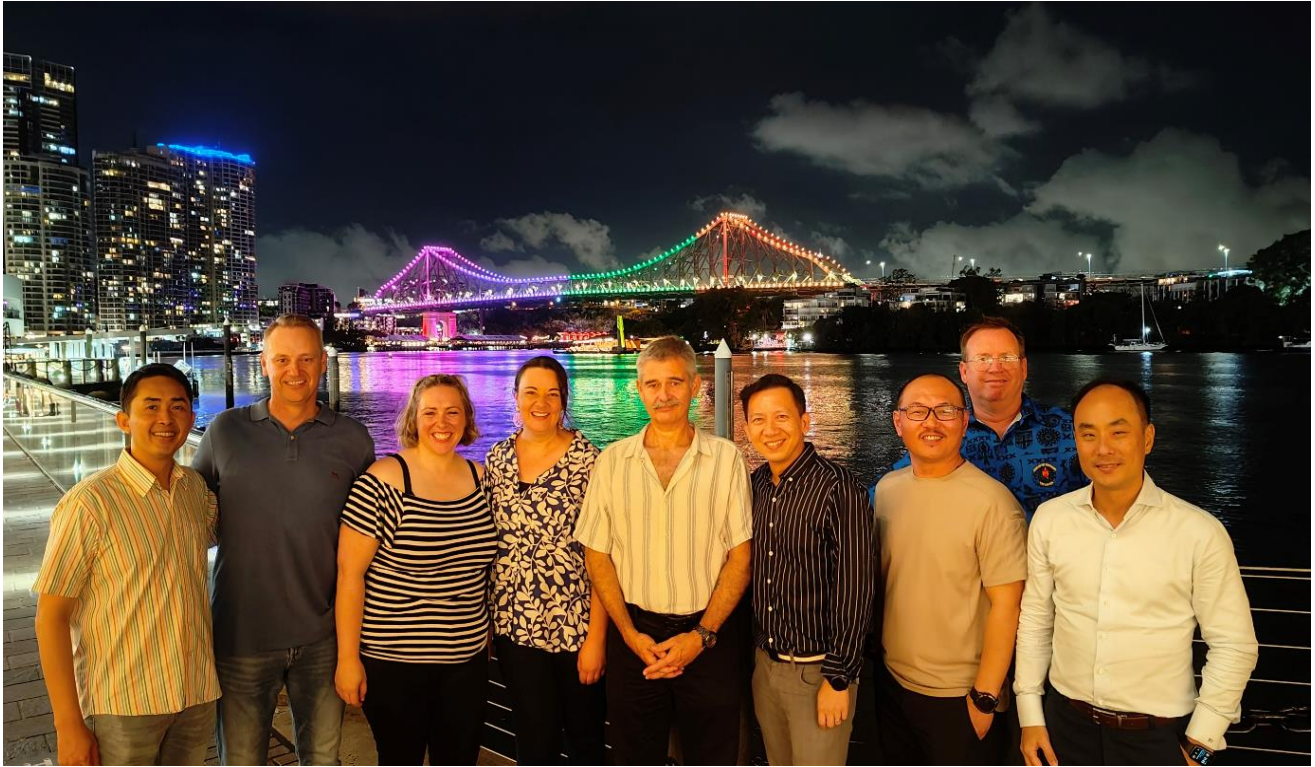
Above: Members of Singapore's Australian Training Area Development Office and Australia's ASMTI Program Office celebrating great bilateral working relationships