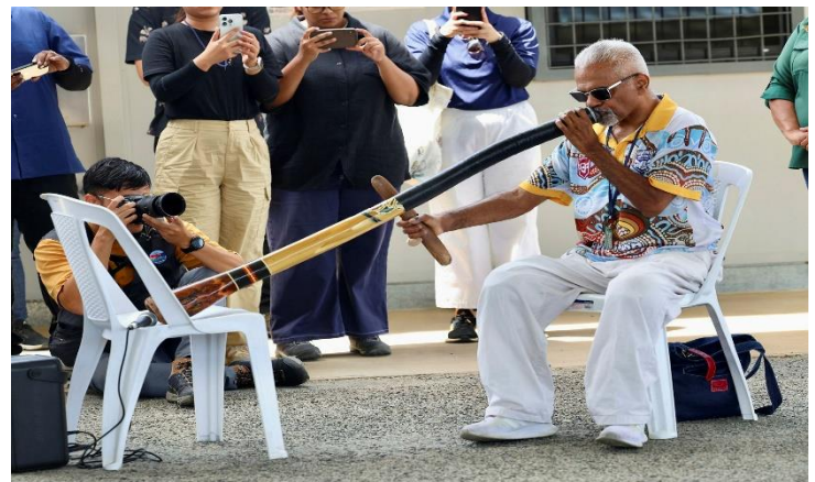
Above: Representative of the Darumbal Traditional Dancers