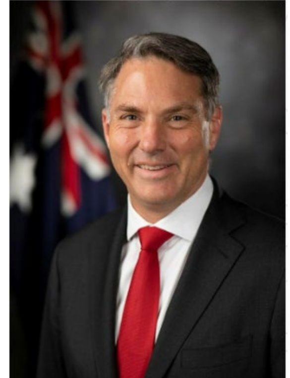
Deputy Prime Minister The Hon Richard Marles MP