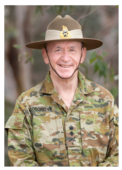
General the Honourable Sir Peter Cosgrove AK, AC (Mil), CVO, MC (Retd)

As Patron of the ADF Cadets, it is a privilege to be involved in what is a unique program that allows us to foster the next generation of community leaders. The ADF cadet programs aim to inspire young people within a safe environment to come together to learn new life skills, make new friends and reach their full potential.