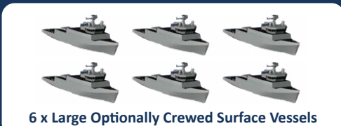
6 x Large Optionally Crewed Surface Vessels