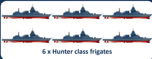
6 x Hunter class frigates

This investment delivers on the Government's commitment to continuous naval shipbuilding in Australia supporting more than 3,700 direct jobs over the next decade in South Australia and Western Australia and delivering a future made in Australia.