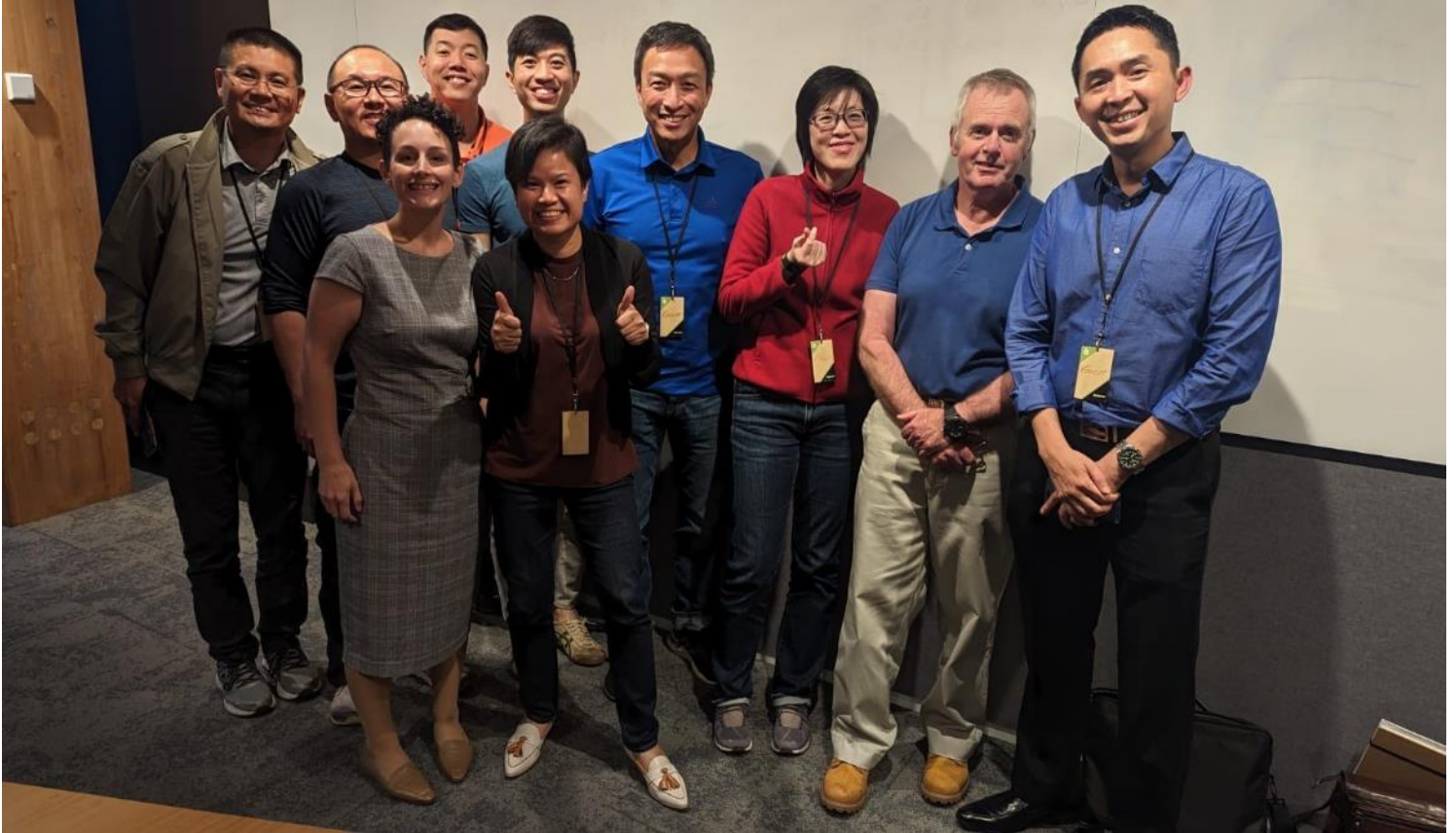
(Above) Representatives from Defence's Australia-Singapore Military Training Initiative Program Office and Singapore's Australia Training Area Development Office at the 26th Training Area Joint Development Working Group

The Australia-Singapore Military Training Initiative Program Office and Singapore's Australia Training Area Development Office convened the 26th Training Area Joint Development Working Group in Brisbane on 9-10 March 2023. This is the primary Australia-Singapore Military Training Initiative working-level meeting with Singapore to steer the implementation of the Australia-Singapore Military Training Initiative.