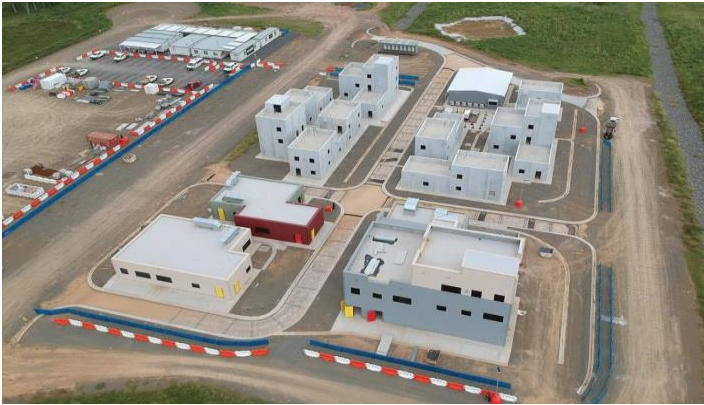
(Above) Oakleigh Urban Operations Live Fire and Training facility