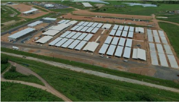
(Above) Camp Tilpal