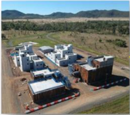
Oakleigh Urban Operations Live Fire and Training facility