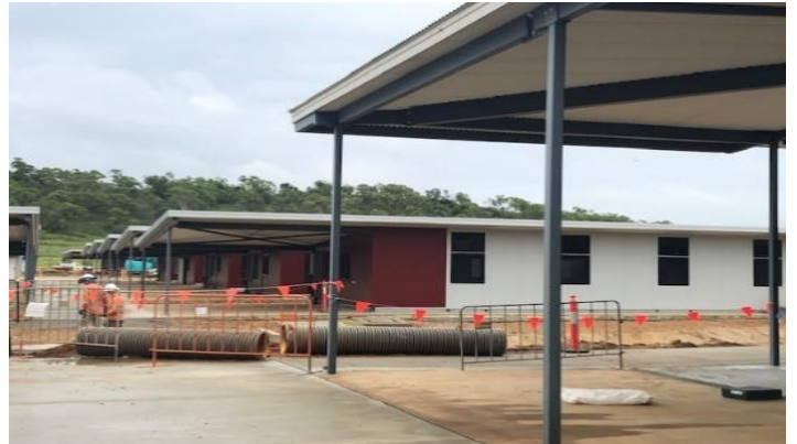
(Above) Camp Tilpal