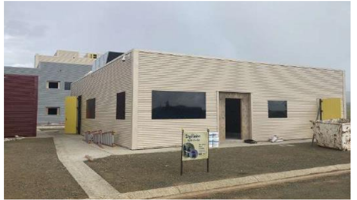
(Above) Oakleigh Urban Operations Live Fire and Training facility