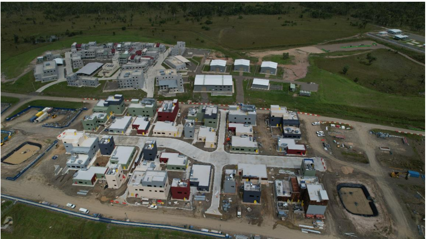
(Above) Foreground: Raspberry Creek Urban Operations Live Fire facility, Background: Urban Operations Training facility