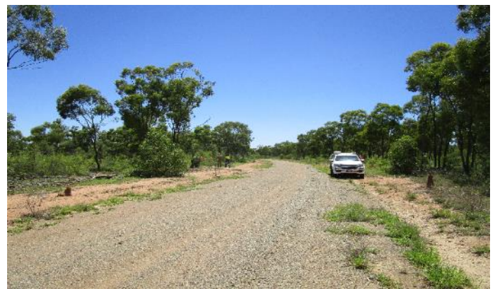
(Above) Porphyry Road – southern entry point