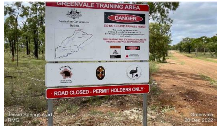
(Above) Jessie Springs Road – northern entry point