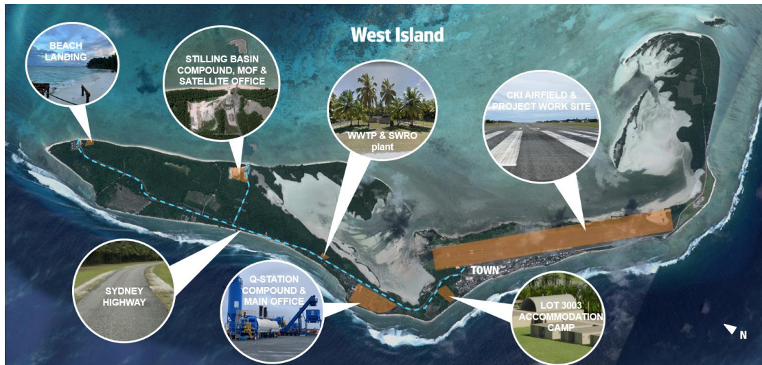
Figure 3: Work element location on West Island