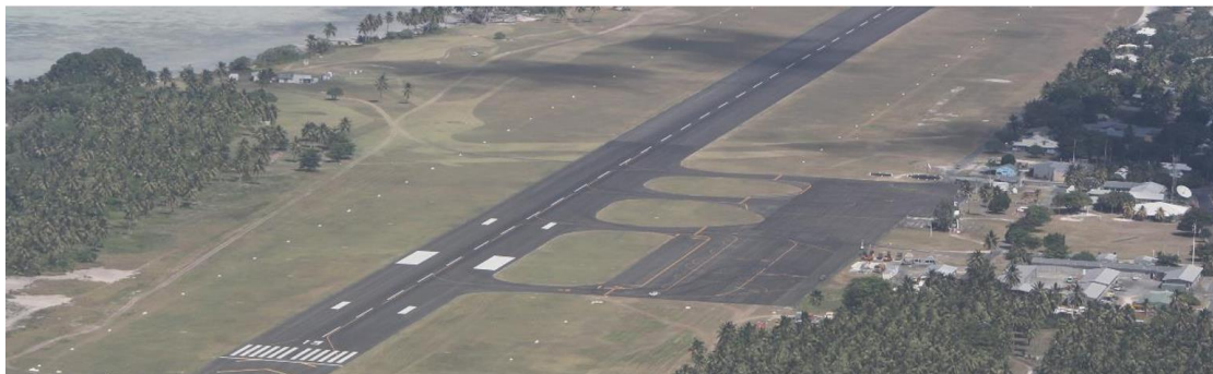
Figure 2: Existing runway

The Cocos (Keeling) Islands Runway Upgrade Project aims to upgrade the airfield at Cocos (Keeling) Islands (CKI) to support Defence’s capability requirements.