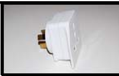
UK to AUS power adapter

If your country of origin does use the same mains voltage as Australia, you will need a power adapter. This enables you to plug your appliances into the power sockets in Australia, which have two flat metal pins fitted diagonally, some may contain a third flat pin (earth pin) in the centre. Voltage converters or power adapters are not required if New Zealand is your country of origin.