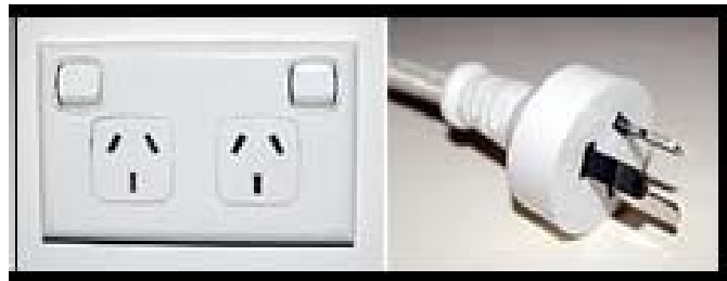
Australian outlet and power cord