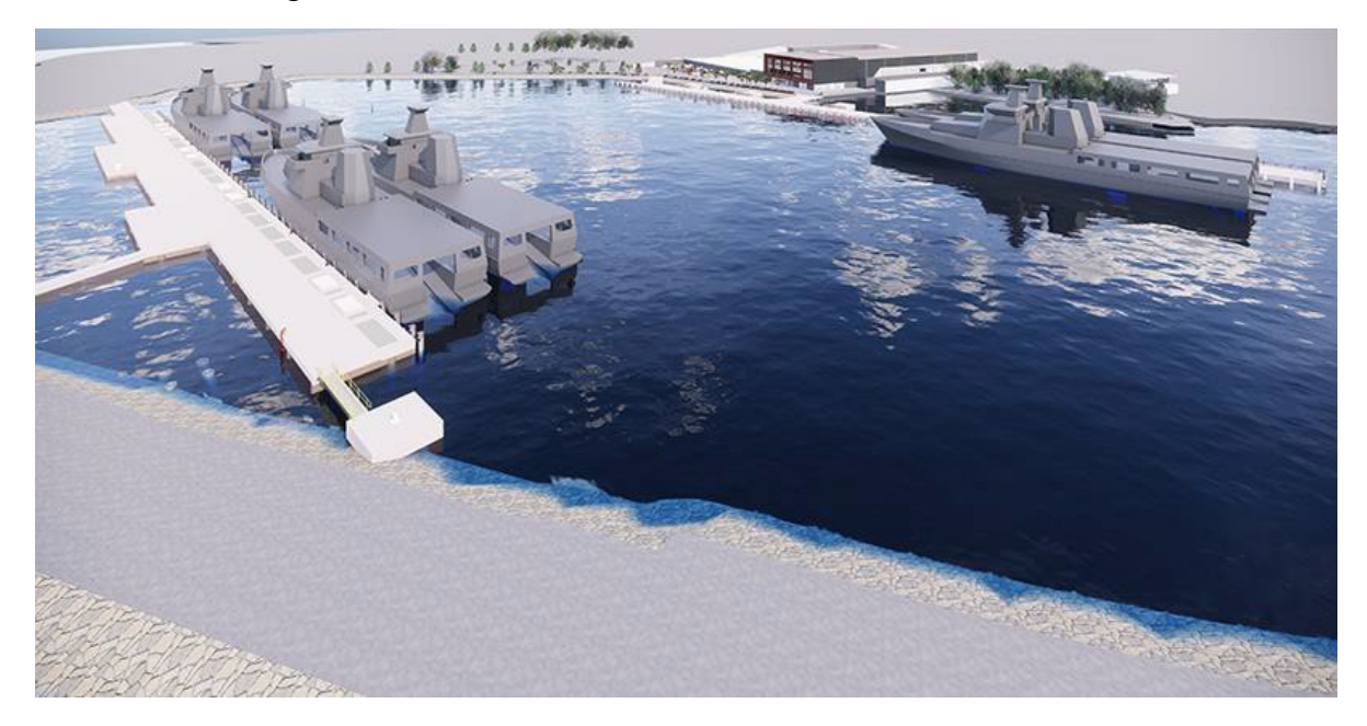
Figure 2: Coonawarra maritime structures - artist's impression

Works include upgrades to both existing wharves, strengthening of the Fremantle Wharf and extension of the Attack Wharf. Dredging of the Coonawarra Basin is also required to cater for the increased draught of the new Arafura Class Patrol Vessels.