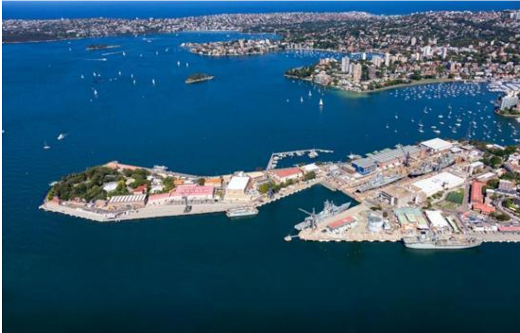
Figure 1: Garden Island - Sydney - aerial view

Garden Island (East) is located between Woolloomooloo Bay and Elizabeth Bay, approximately two kilometres north-east of the centre of Sydney's Central Business District. The works proposed under Stage Two are located on both Defence-owned land and land leased from the NSW Government.