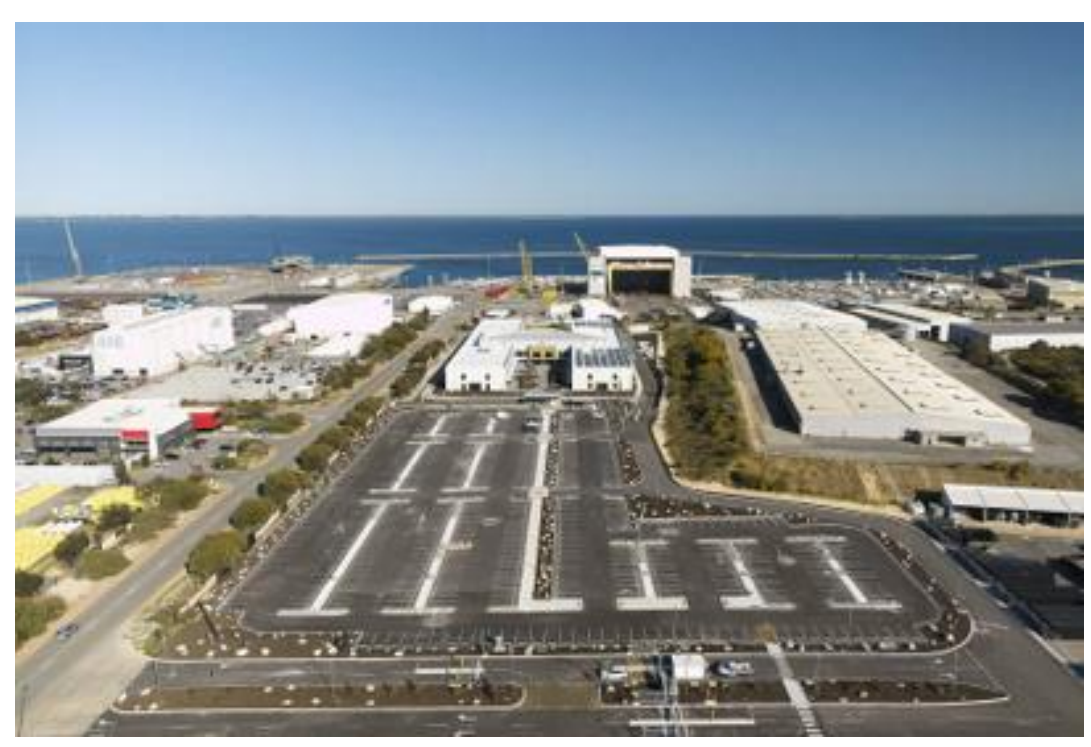
Figure 2: Henderson office accommodation