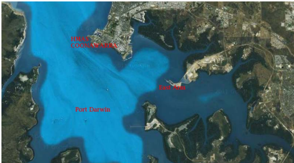
Figure 3: Darwin harbour, showing HMAS Coonawarra and East Arm wharf.