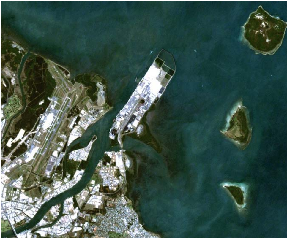
Figure 2: Satellite map of the Port of Brisbane showing the Fisherman Islands wharf facilities in the centre. A supplementary fleet base could be developed at a new reclaimed land site extending further into Moreton Bay from the current facilities and linked to the Port of Brisbane by a causeway (Source: Geoscience Australia).