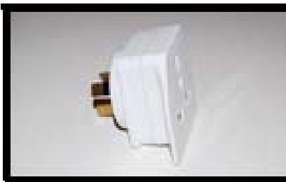
UK to AUS power adapter

If your country of origin does use the same mains voltage as Australia, you will need a power adapter. This enables you to plug your appliances into the power sockets in Australia, which have two flat metal pins fitted diagonally, some may contain a third flat pin (earth pin) in the centre. Voltage converters or power adapters are not required if New Zealand is your country of origin.