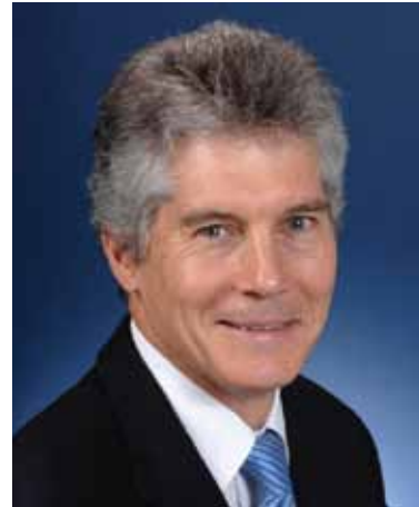
Stephen Smith MP Minister for Defence