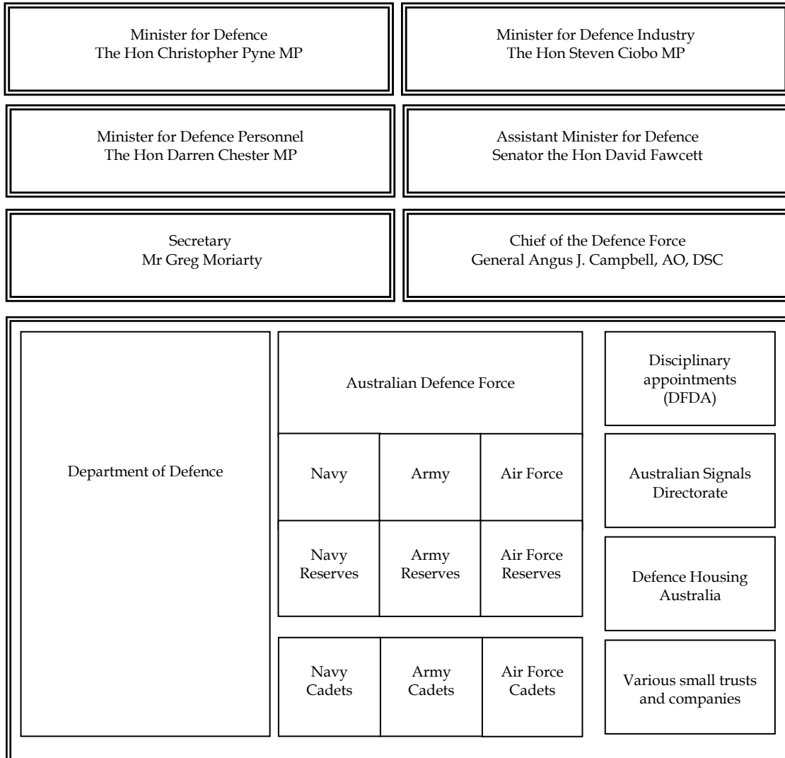
Figure 1: Defence Portfolio Structure and Outcomes